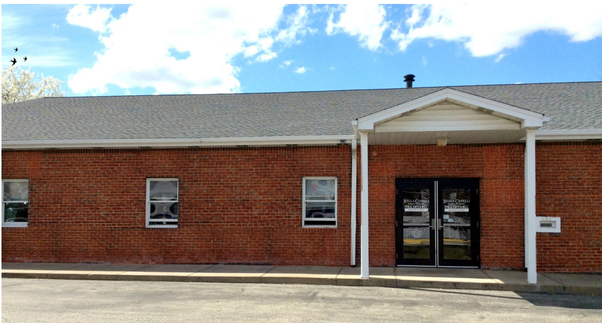
BELLA CAPELLI ACADEMY - located in Monroeville